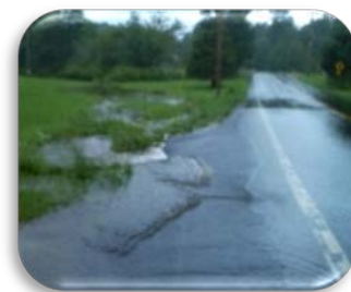
Photo: Stormwater runoff from impervious surfaces